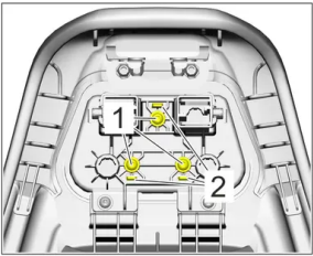
Retainer plate for guide part